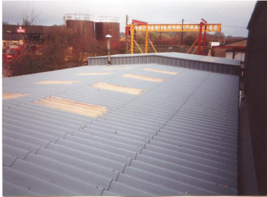
Roofcoat System applied to existing roof

The following guideline specification is based on application of the advanced Roofcoat Plus System to asbestos sheets.