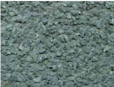
'Blue mineral slate'

Apply Polyroof 185C Flexi-resin at a minimum coverage rate of 0.6Litres/m 2 (1.68m 2 /Litre) and whilst wet broadcast Mineral Slate Grit at a minimum coverage rate of 2.5kg/m 2 . Once cured remove loose grit. Approximate finished coverage rate of grit will be 1.5kg/m 2 and the remaining grit may be recovered for future use.