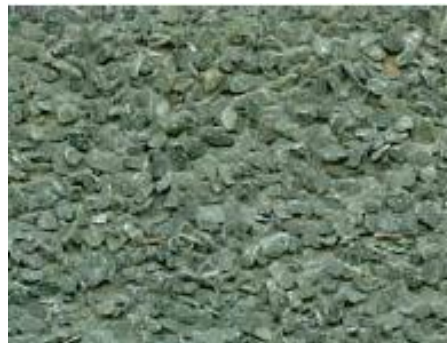
'Green mineral slate'